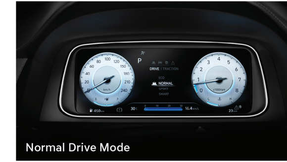
Normal Drive Mode