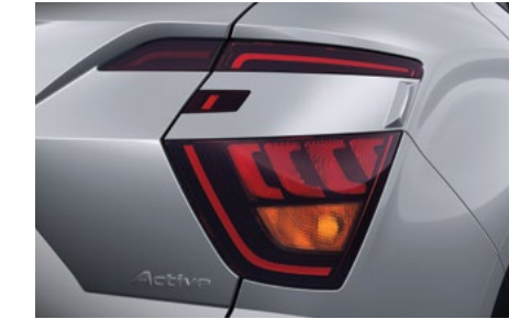
LED Rear Tube Lamp