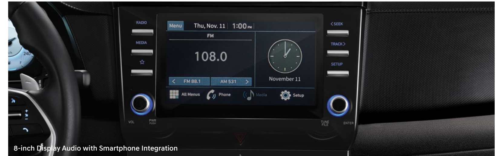
8-inch Display Audio with Smartphone Integration