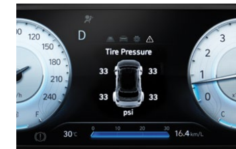
TPMS (Tire Pressure Monitoring System)