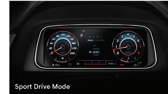
Sport Drive Mode