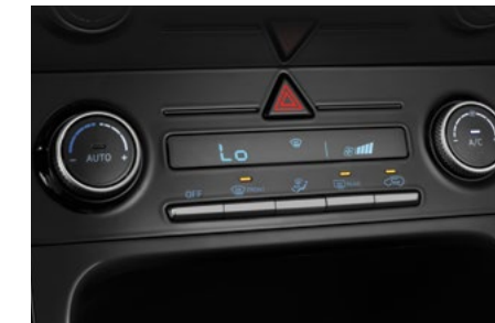
Full Automatic Temperature Controls