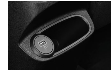
Rear USB Charging Port