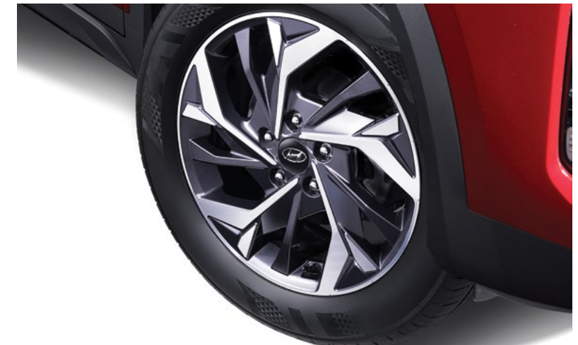
17-inch Diamond Cut Alloy Wheels