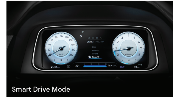
Smart Drive Mode