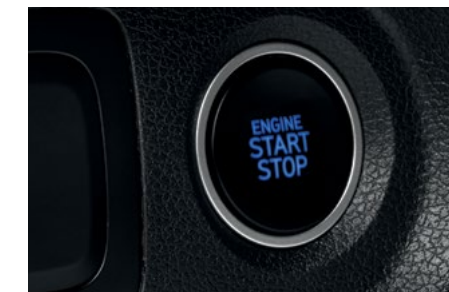
Push Start Button