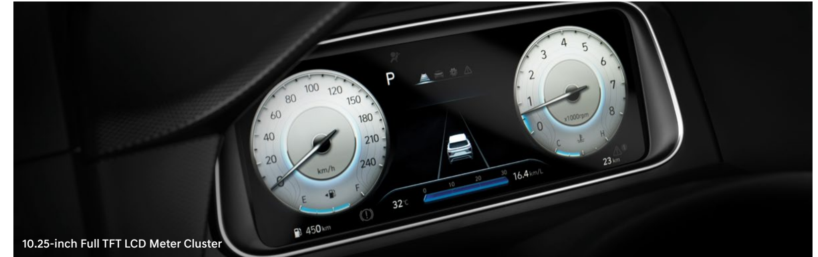
10.25-inch Full TFT LCD Meter Cluster