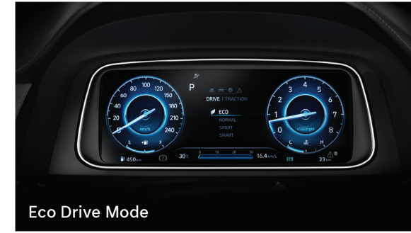
Eco Drive Mode