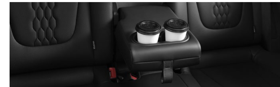
Rear Center Armrest with Cup Holders