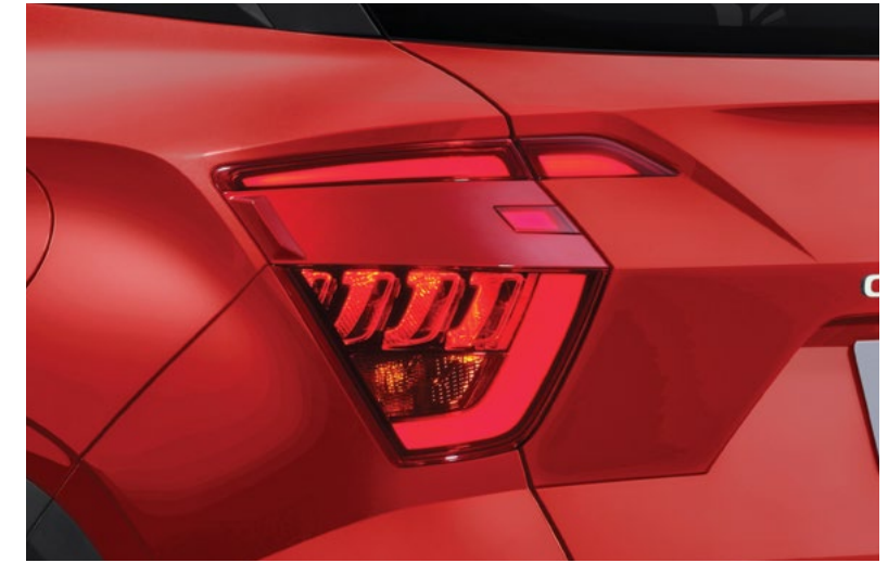
LED Rear Combination Lamp