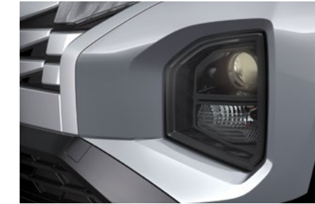
Halogen Projection Headlamps