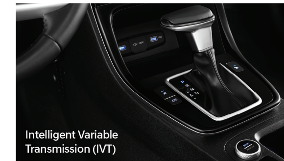
Intelligent Variable Transmission (IVT)