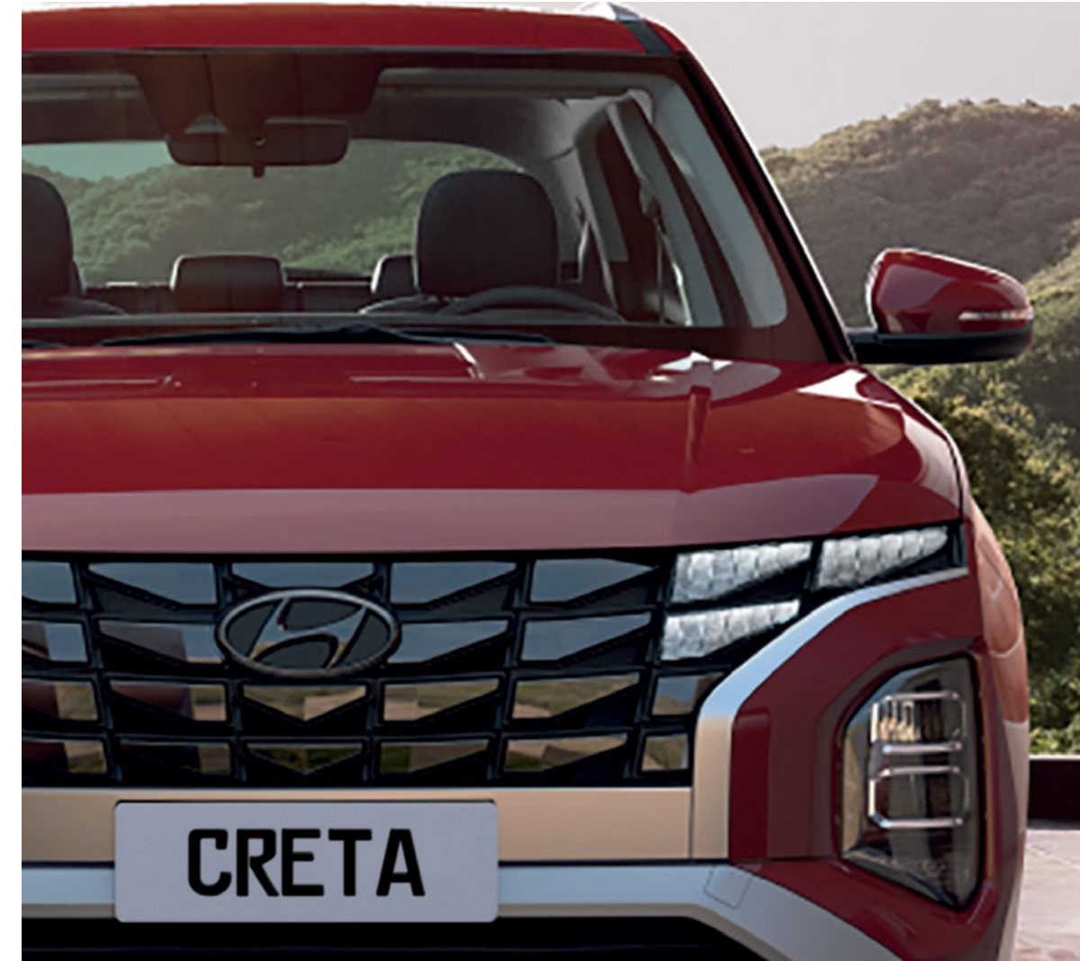
Parametric Jewel Pattern Grille & Hidden-type LED DRL