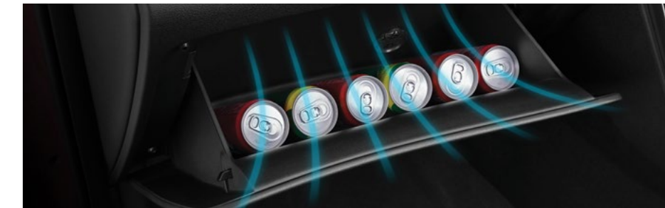
Cooling Glove Box