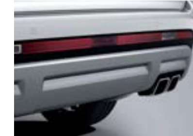
Rear fog lamps