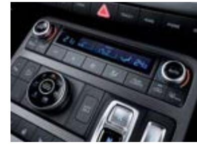
Full auto air conditioning system