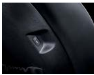
USB charging ports