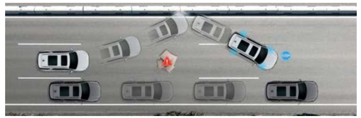
Rear Occupant Alert (ROA) Multi-Collision Brake (MCB) System