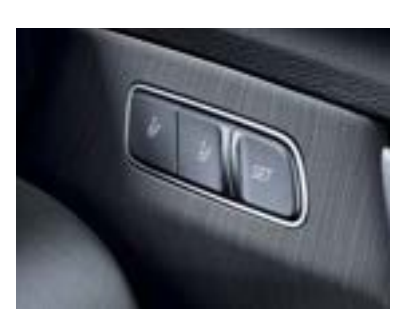
Integrated Memory System