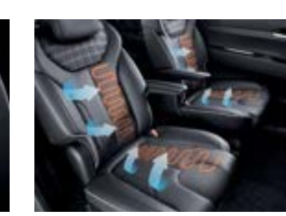
Ventilated & heated 1st & 2nd seats