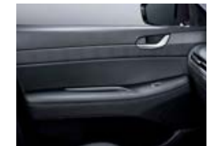
Leatherette door armrest