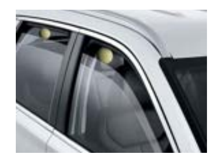
Speed variable safety power windows