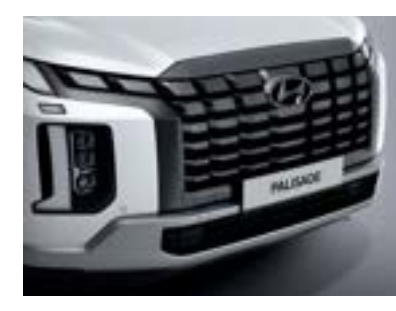
Dark chrome radiator grille