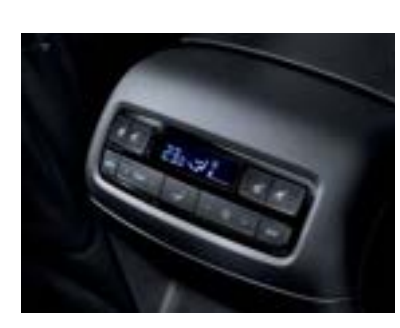
Three-zone, Independent-control, fully automatic air conditioning