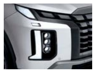
Full LED headlamps