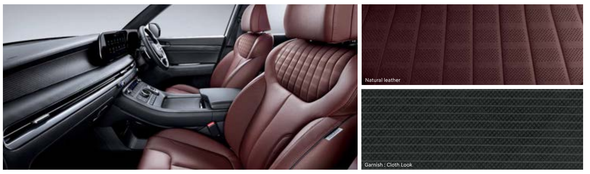
Burgundy Color Package Interior