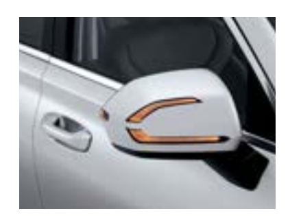
LED outside mirror repeaters