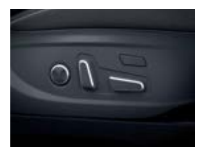
8-way power driver's seat with 2-way lumbar support