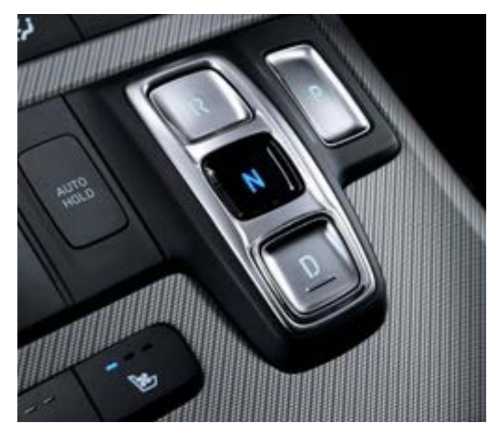
8-speed shift-by-wire automatic transmission

HTRAC All-Wheel Drive & Multi Terrain Control