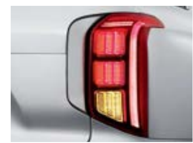
Full LED rear combination lamps