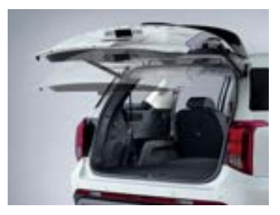
Smart tailgate system