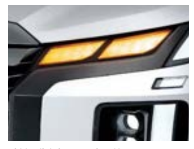
Hidden lighting turn signal lamp