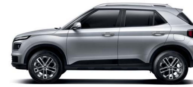
Overall Length 3,995 Wheel Base 2,500