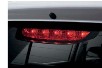
High-mounted stop lamp