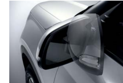
Electric folding mirrors