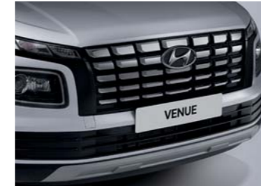
Dark chrome grille