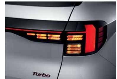
LED rear combination lamp