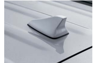
Shark fin antenna