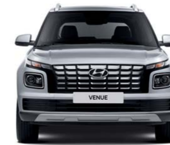
Overall Width 1,770