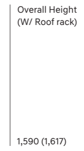
Overall Height (W/ Roof rack) 1,590 (1,617)