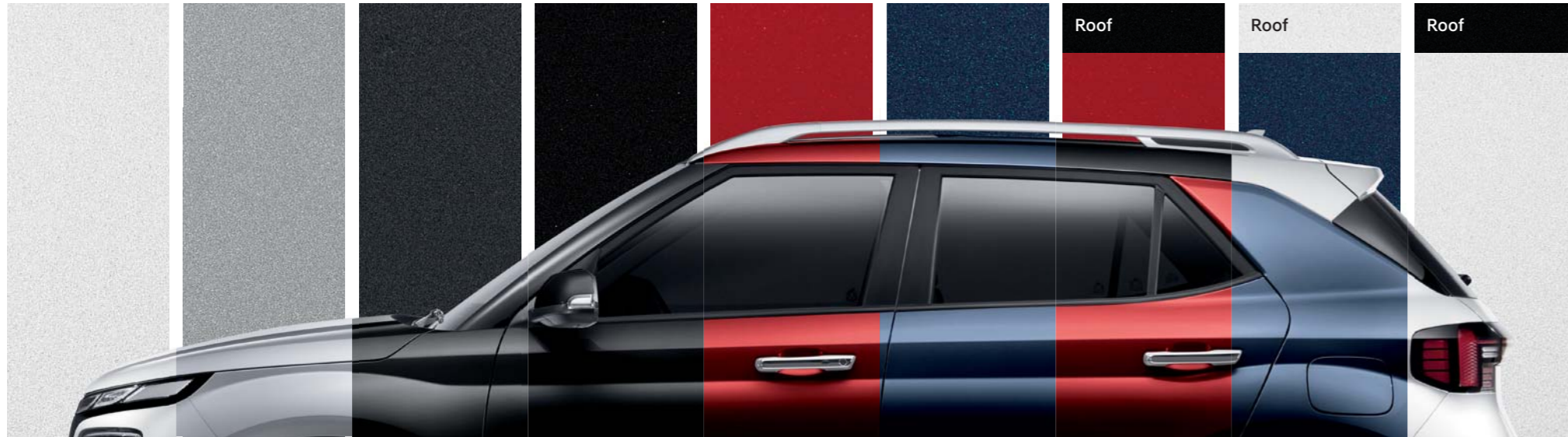
PWT Polar White T2X Typhoon Silver Metallic R4G Titan Grey Metallic X5B Phantom Black Pearl R4R Fiery Red Pearl TN6 Denim Blue Pearl RR6 Fiery Red Pearl + Black Roof TN3 The Denim Pearl + White Roof TTB Polar White + Black Roof