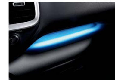
Ambient mood lamp