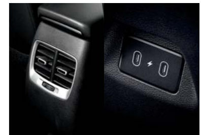
Rear air vent & USB charger (2port)

* Features and specifications vary by market. Please consult your local dealer.