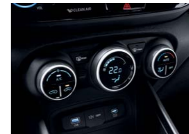
Full auto air conditioning system