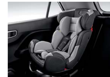
Child anchor system