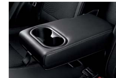
Center rear armrest with cup holders