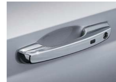
Chrome-coated door handles