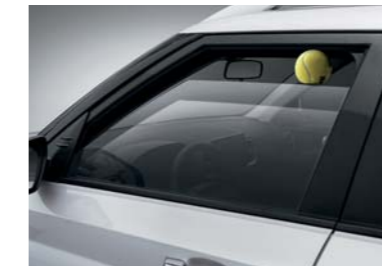
Safety windows (Driver)