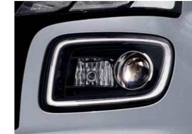
LED MFR headlamps & LED DRLs