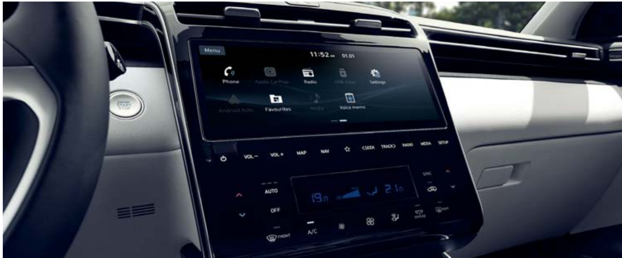
10.25" LCD touchscreen