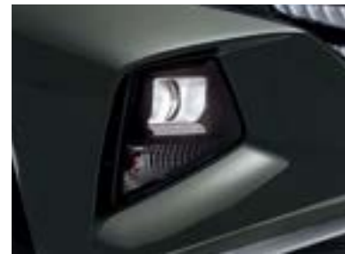
Projection headlamps (Standard)