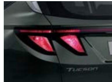
Rear combination lamps (Standard)