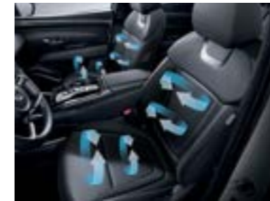
Ventilated front seats