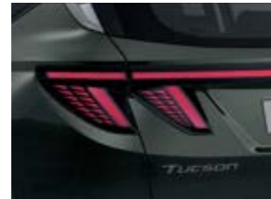
LED rear combination lamps (Optional)