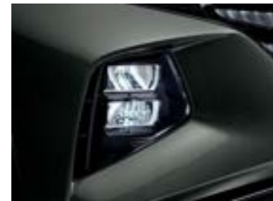
MFR LED headlamps (Optional)