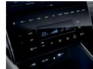
Full auto air conditioning system