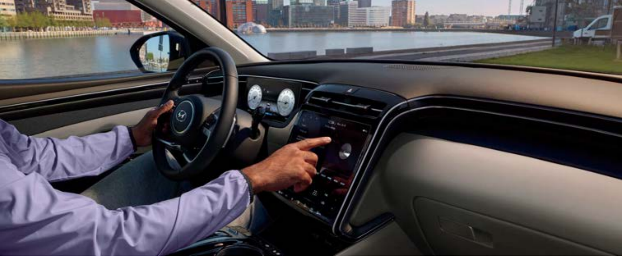
Full-touch center fascia (Personalized profiles)