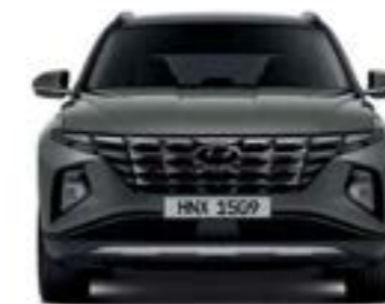
Overall Width 1,865 Wheel Tread* 1,615