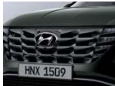
Silver paint radiator grille