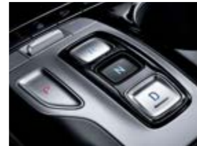
Shift-by-wire automatic transmission (Optional)