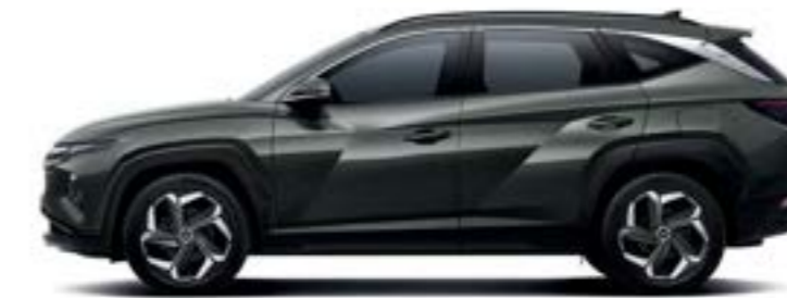
Overall Length 4,630 Wheel Base 2,755