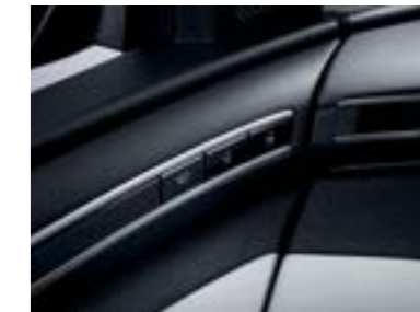
Integrated memory system (IMS)