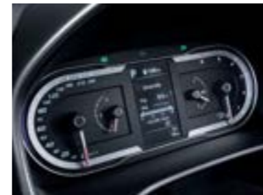
4.2" TFT LCD Supervision cluster