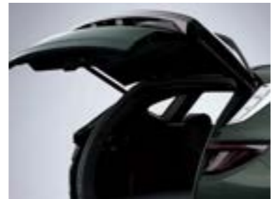
Smart tailgate system