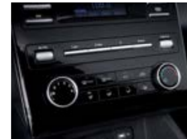
Manual air conditioning system