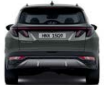
Wheel Tread* 1,622

Unit : mm * Wheel tread • 17" Wheel (Front/Rear) : 1,620/1,627 • 18" Wheel (Front/Rear) : 1,615/1,622 • 19" Wheel (Front/Rear) : 1,615/1,622