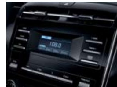
3.8" Standard audio system