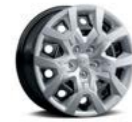
17" Steel Wheels