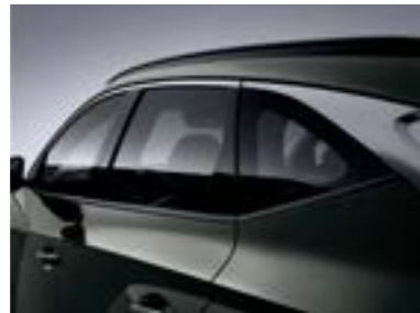
Chrome-coated beltline molding