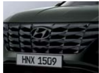
Dark black chrome radiator grille