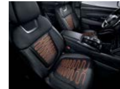
Heated front seats