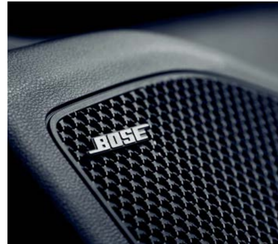
Bose premium audio