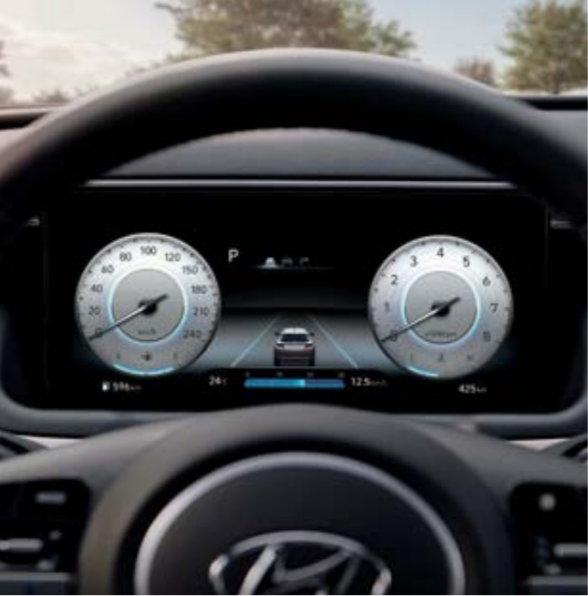
10.25" open cluster