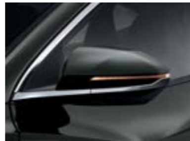
Outside mirror LED repeaters (Optional)